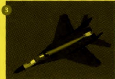
Texturing the model